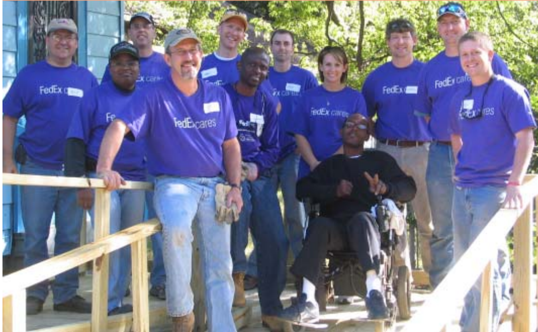
FedEx employees served as volunteers for the community during the organization's third annual "FedEx Cares Week," October 8th thru 12th last year. Locally and nationally, FedEx employees served as volunteers at numerous non-profits and learned how crucial it is to contribute to programs that greatly impact people's lives. In this photo, FedEx employees stand on a wheelchair ramp they constructed to help increase the mobility of a Mid-South citizen who uses a wheelchair.

United Way of the Mid-South is improving lives by uniting community resources. Serving Crittenden, DeSoto, Fayette, Lauderdale, Shelby, Tate, Tipton and Tunica counties.