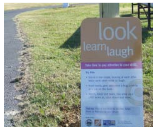
Signs at the Wonder Trail at Frazier Park inform parents how they can help teach children the alphabet as they enjoy a walk together

Wonder Trails is part a national public engagement campaign helping parents, caregivers and communities create early learning opportunities for young children. The program is built on awareness, education and action.