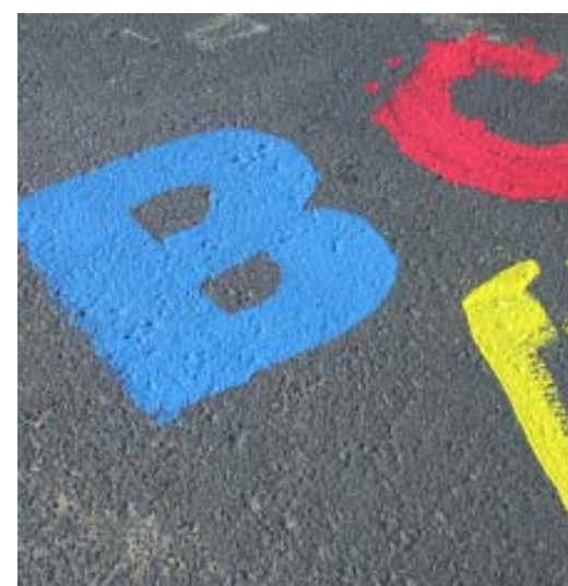
Wonder Trails feature letters and numbers in colorful configurations to help children learn the basics as they walk with their caregivers.