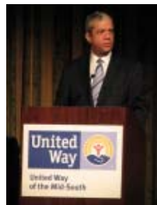
Shelby County Mayor Joe Ford addresses the Annual Meeting & Campaign Celebration crowd