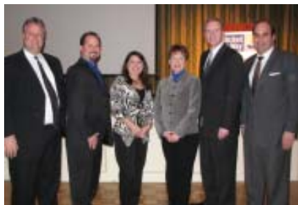
Members of the Wanzer family and Porter Leath executives celebrate Porter Leath's honor for being awarded with the 2010 G. Bradley Wanzer Award for Excellence