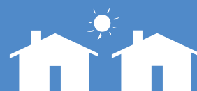
Building vital and safer neighborhoods