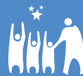
Helping children and youth succeed