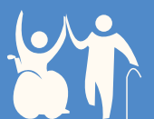
Enhancing the lives of adults with disabilities and seniors

Your support of United Way of the Mid-South makes a difference in people's lives... and that's what matters.™